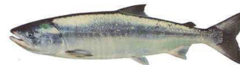
Chum Salmon S/D & H/G Seasons: July - August