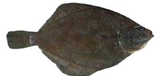
Rock Sole W/R & H/G Seasons: Feb - April & June - Nov