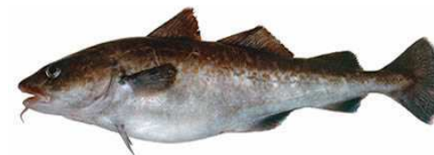
Pacific Cod H/G Seasons: June - November