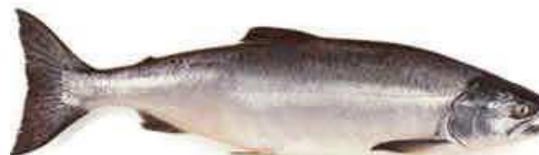
Pink Salmon S/D & H/G Seasons: July - September