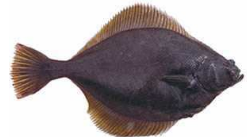
Yellowfin Sole W/R & H/G Seasons: Feb - April & June - Nov